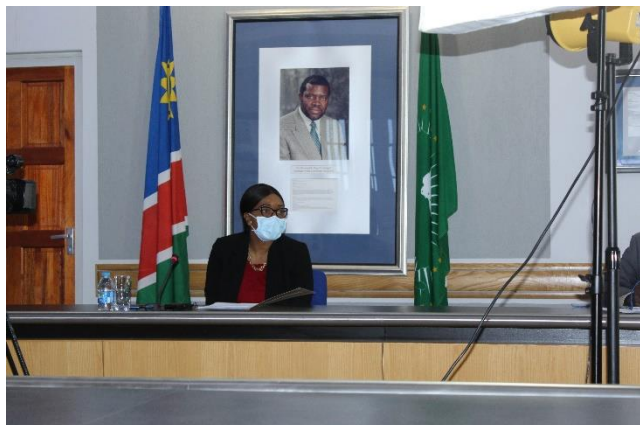
Hon. Dr. Saara Kuugongelwa-Amadhila Prime Minister