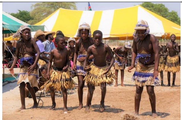
Ngwangwa Primary School Cultural Group Showing appreciation by colourful and dynamic dance to the drumbeat