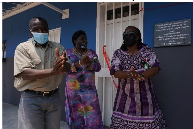
Ndama Combined School Unveiling of Commemorative Plaque Hon. Nghipondoka, Minister of Education, Arts and Culture (right) Hon. Kauma, Vice Chairperson, National Council (Centre) Hon. Wakudumo, Governor, Kavango East Reion (left)