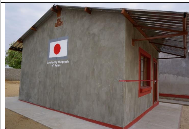
Sikanduko Primary School New counselling room