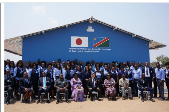
Ndama Combined School's new classroom block Dignitaries (front row) and 68 teachers (at the back)