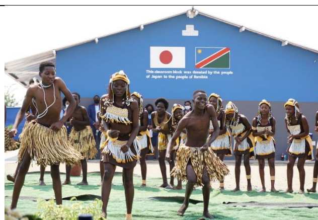
Ndama Combined School Cultural Group Performance showing their gratitude