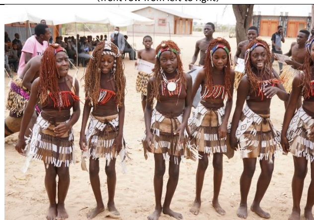
Sikanduko Primary School Cultural Group Performance showing their gratitude