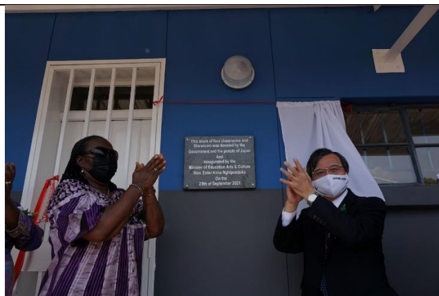
Ndama Combined School Unveiling of Commemorative Plaque Hon. Nghipondoka, Minister of Education, Arts and Culture (left) Ambassador Harada (right)