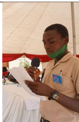
A representative from Ngwangwa Primary School Vote of Thanks