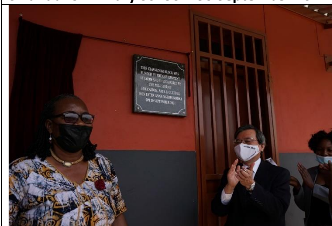
Sikanduko Primary School Unveiling of Commemorative Plaque Hon. Nghipondoka, Minister of Education, Arts and Culture (left) Ambassador Harada (right)