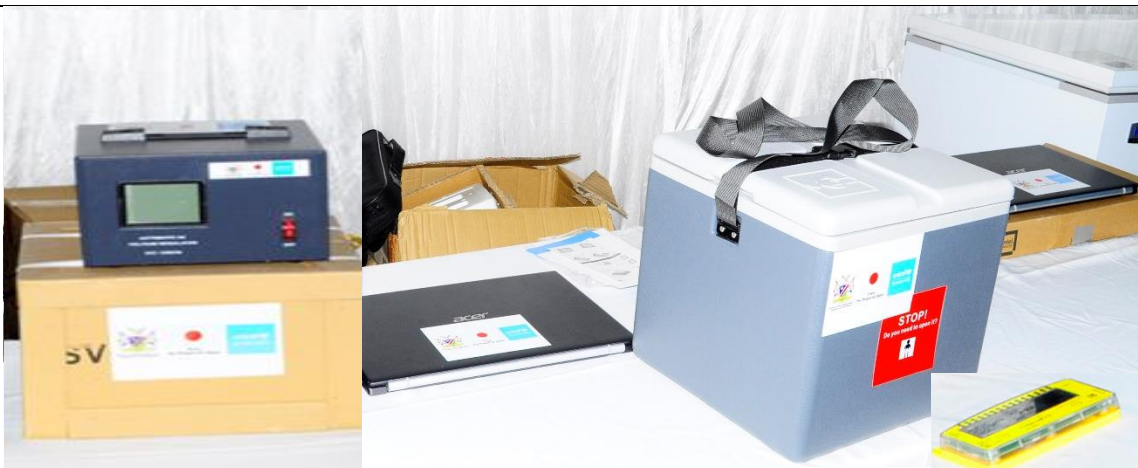
Voltage Stabilizer, Laptops, Ultra-Cold Chain Equipment, Temperature monitoring device