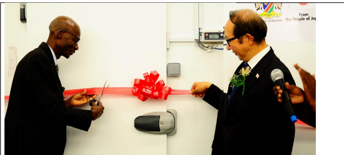
Cutting the ribbon at the donated fully installed functional Walk In Cold Room for Khomas Region.