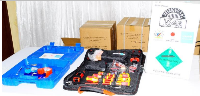
Toolkits and Spare Parts to maintain the cold chain equipment.