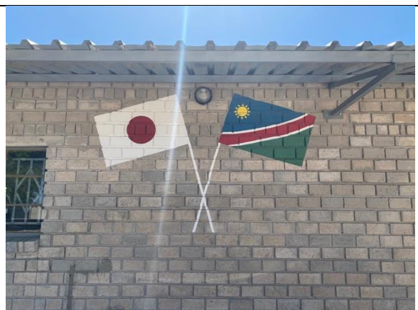
Photo 4: Japanese and Nambian Flag Painted on the Constructed Classroom Block at Savo Nuts Private School