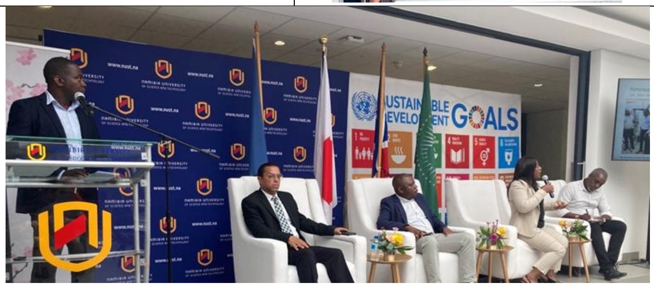
Moderated Panel presentation of project elements which was followed by questions and answers session.