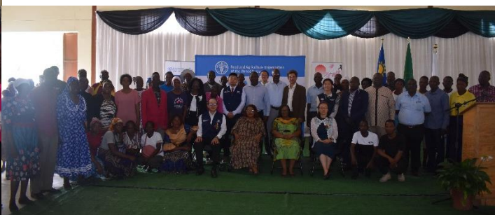
Above: Over 200 horticulture farmers from across the Kavango West Region attended the conference.