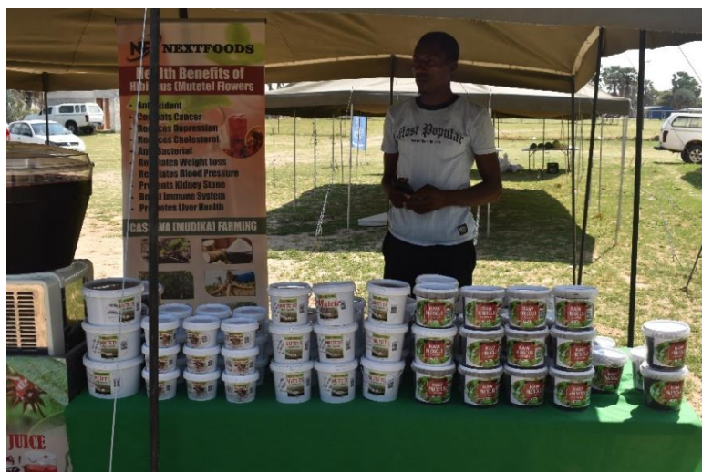
Some farmers were afforded the opportunity to showcase and market their produce at the conference.