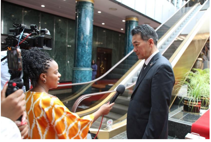
Ambassador Asazuma engaging with the media