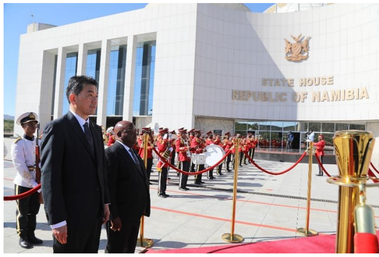
Ambassador Asazuma and Ambassador Iipumbu observe the hoisting of the National Flag of Japan, concurrently with the National Anthem of Japan by the band.