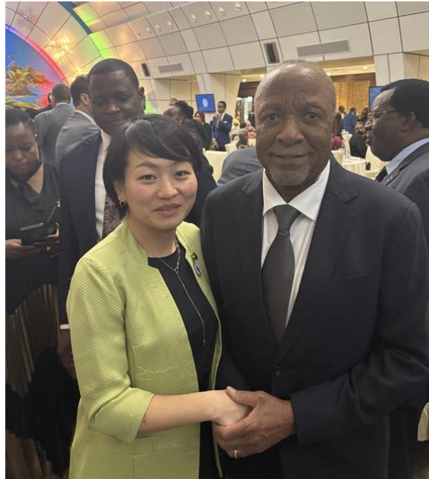
With President H.E. Dr. Mbumba