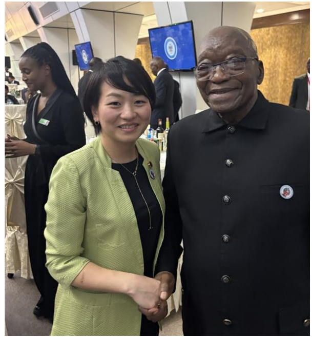
With Mr. Zuma, former President of South Africa