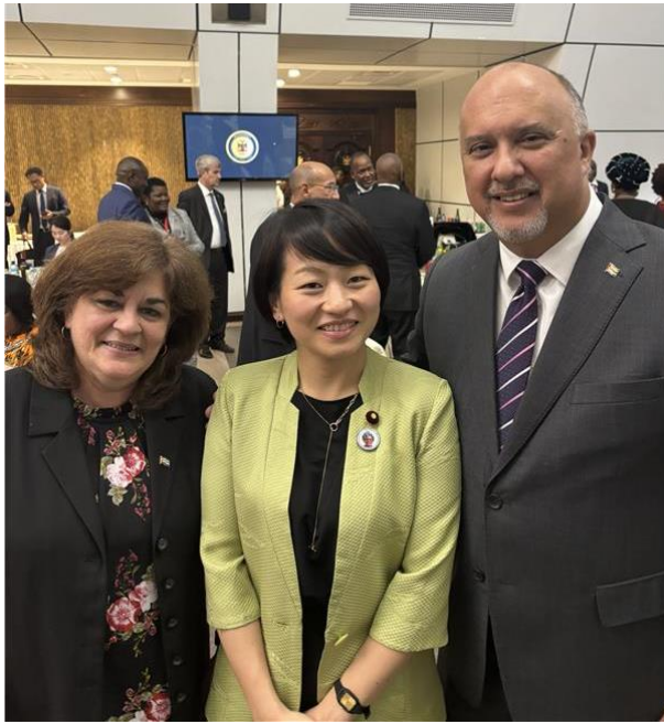
With H.E. Marrero, Prime Minister of Cuba(right)