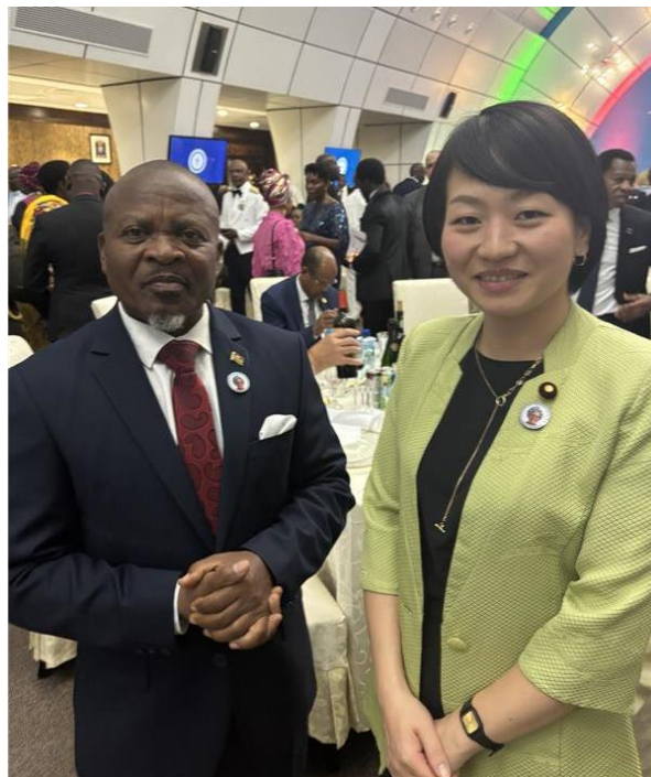
With Hon. Dr. Usi, Vice President of Malawi